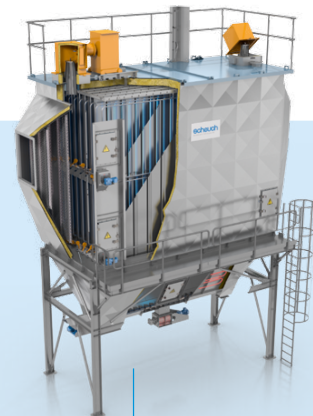
SCHEUCH ELECTROSTATIC PRECIPITATOR